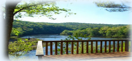
Spirewell Bluff State Park, Thomaston, GA